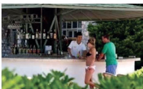
Nimara Snack Bar