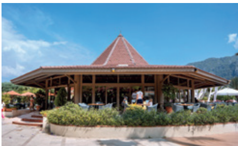
Otag Bar ( Mimoza & Mediterranean Fish Restaurant )