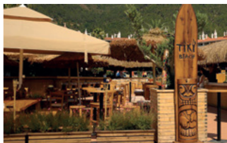
Tiki Beach Restaurant & Bar